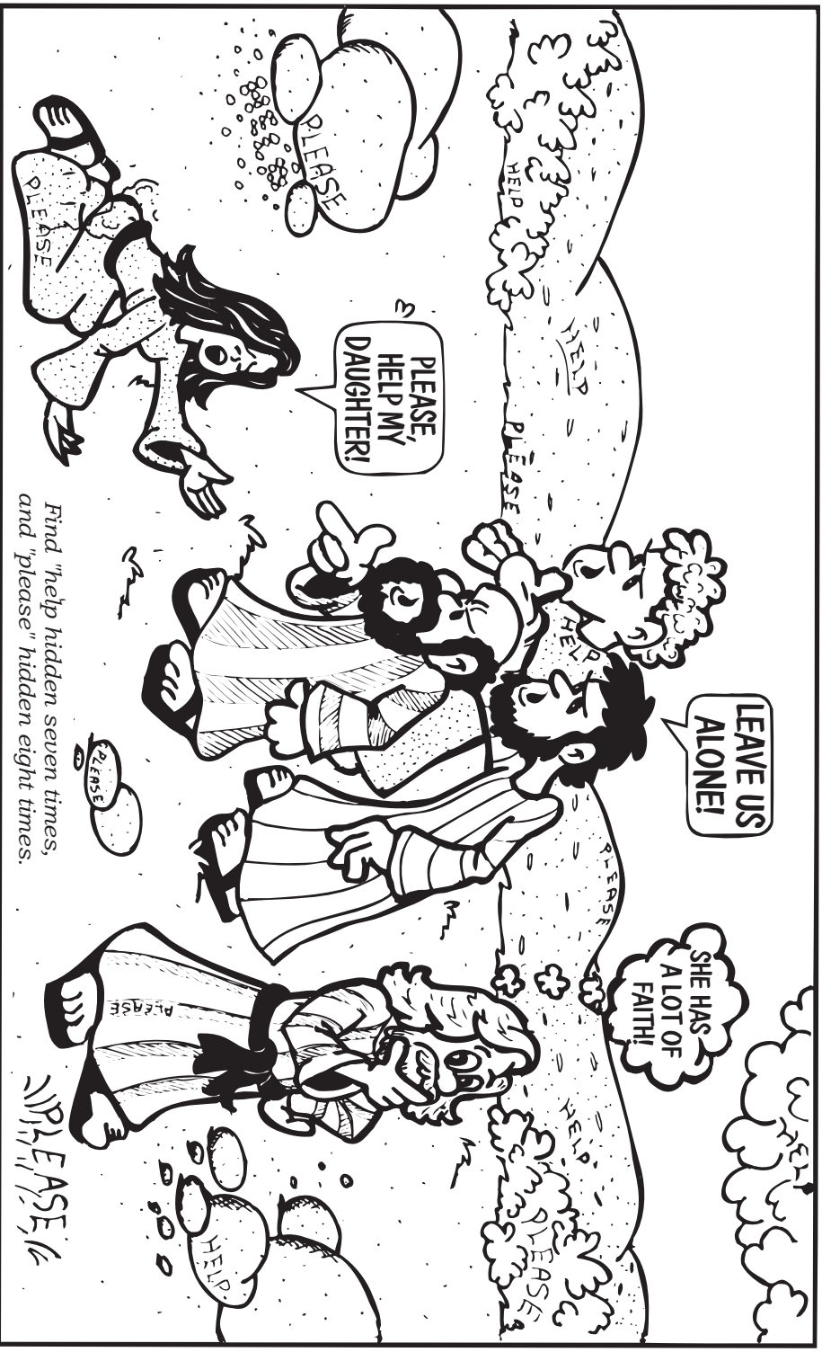
Find "help" hidden seven times, and "please" hidden eight times.